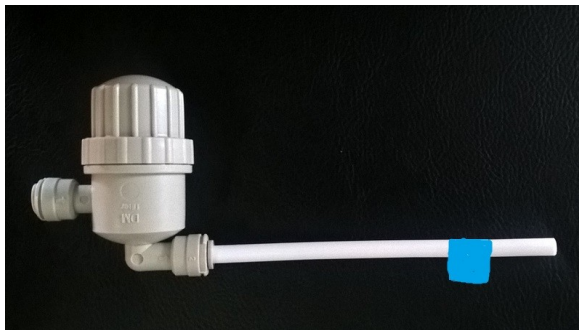
Step 1- Locate Flow Restrictor Assembly tubing with Blue tape.

When Re-installing your ionizer, it will be necessary to also install the enclosed Flow Restrictor Assembly at the Tap Water inlet. Please refer to the following photos for proper installation.