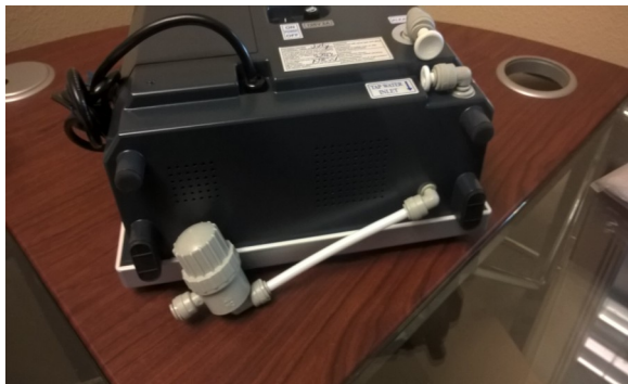
Step 3- Make sure the tubing is fully inserted to port. Your ionizer should now look like this.