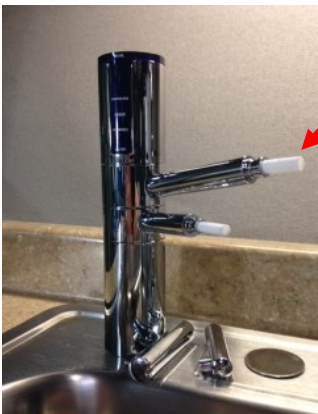
Correct—White Tubing Showing

IMPORTANT: When connecting Faucet Tower tubing to Base Unit, be careful not to pull on the white tubing. White tubing must extend out of both spouts. If the tubing is pulled in, it will leak and cause damage to the Faucet Tower. To illustrate, in the pictures below the faucet tips have been removed from the faucet spouts.