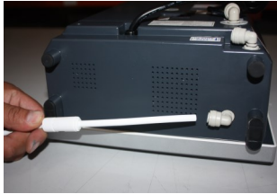
2. Install at Tap Water Inlet