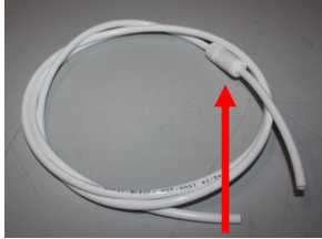
1. Dust Pre-Filter comes attached

A dust pre-filter is included with all ionizer models. The dust pre-filter is pre-installed on the 1/4" tubing that should be installed at the tap water inlet. See photos below. NOTE: Your Dust Pre-Filter may look different than the picture.